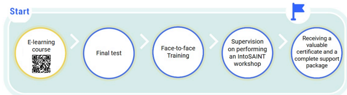
The 5 steps to becoming a certified IntoSAINT moderator

The online course offers a useful introduction, but face-to-face training remains mandatory to become a certified IntoSAINT moderator .